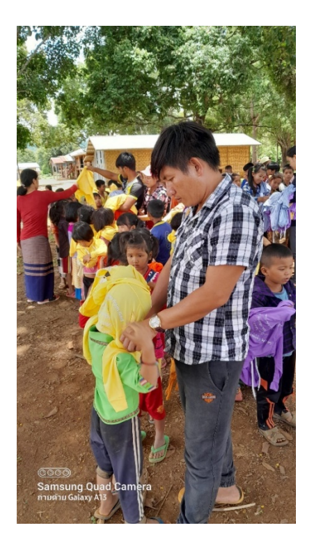
Good Life Club and Pong School, Hai Hpak, Nansang, Shan State Burma: Rangers distribute new GLC shirts to children during a GC program.