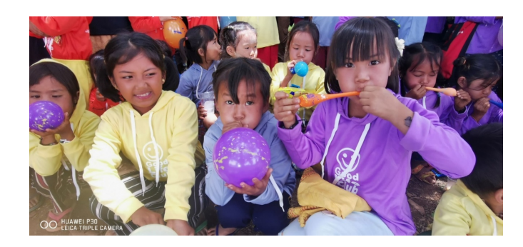
Good Life Club and Pong School, Hai Hpak, Nansang, Shan State Burma: GLC program.