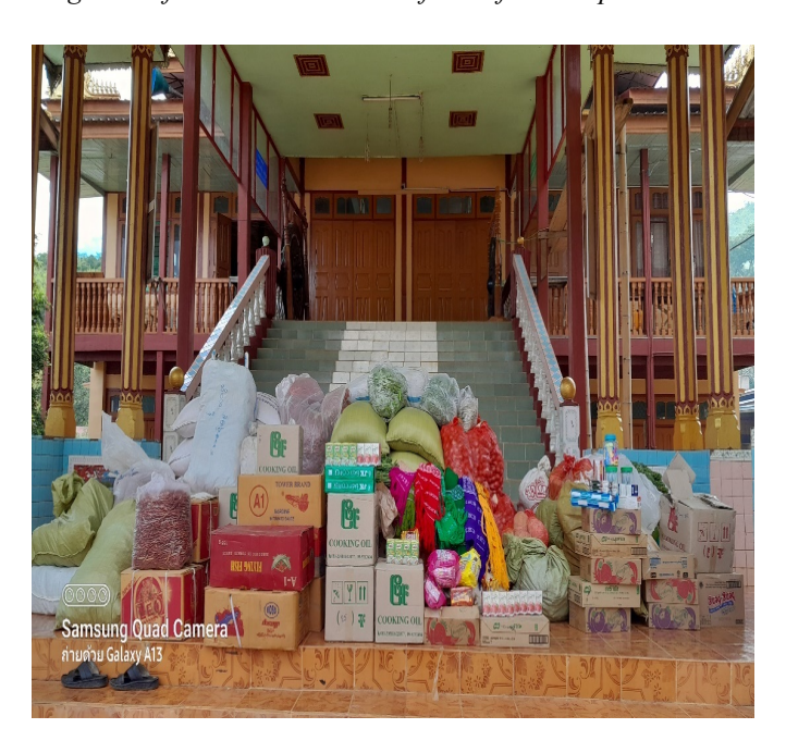
Waan Won Som, Loikaw, Karenni State: The food supplies were given to the monk of the temple and will be distributed to the IDPs.