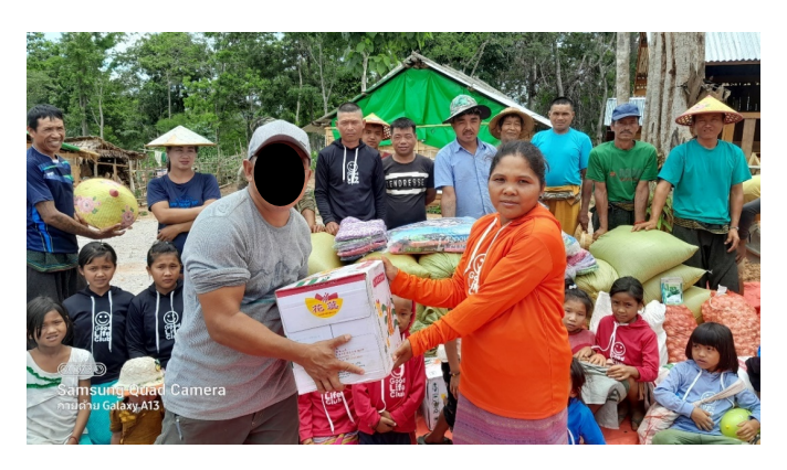
Waan Nam Hu, Keng Tawng, Loi Lem, Shan State Burma: Shan Ranger distributes cooking supplies to IDP families.