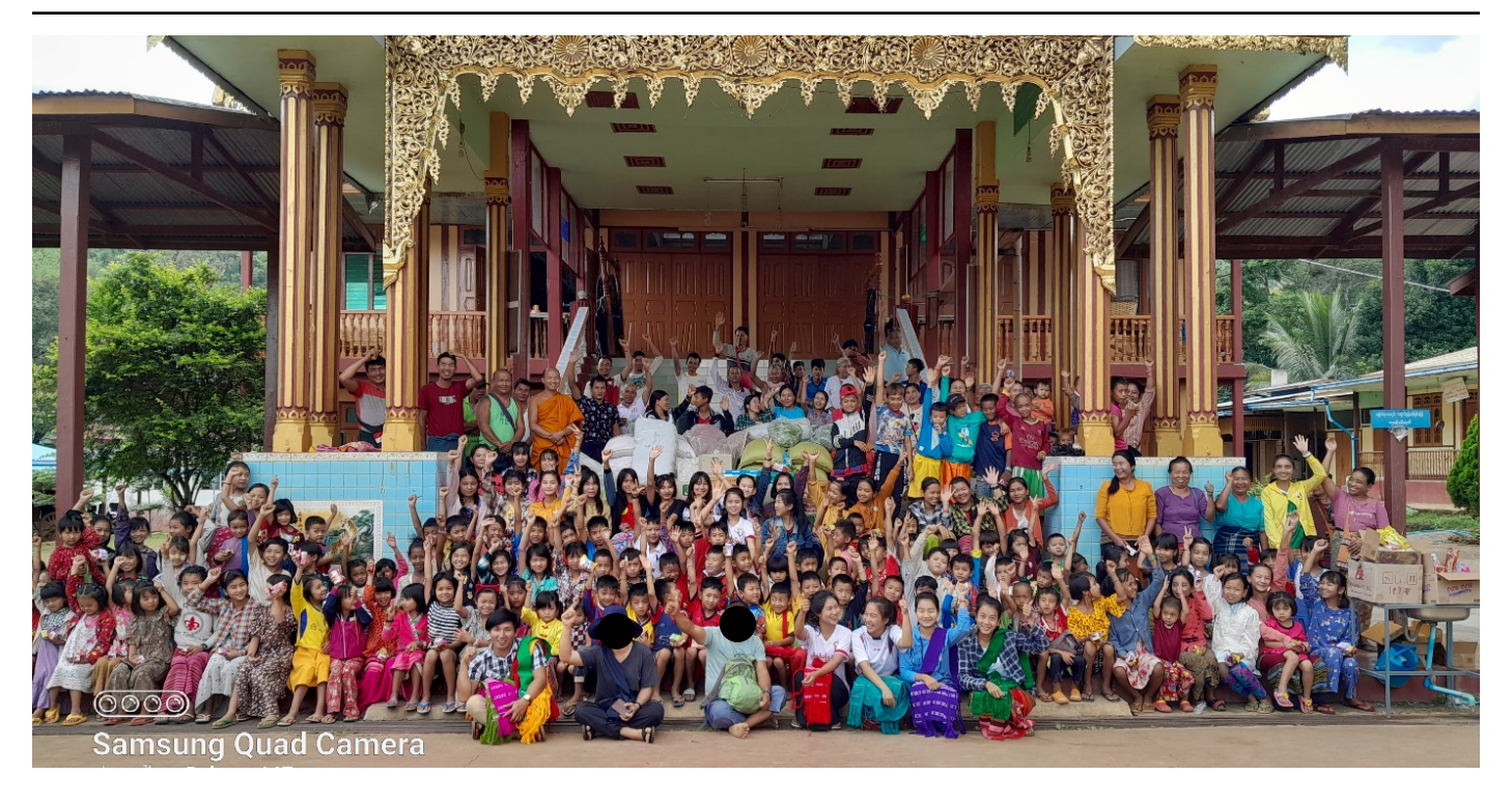
Waan Won Som, Loikaw, Karenni State: This photo was take after the Shan Ranger Relief Team completed a small program at the temple. They sung songs, taught hygiene, gave food and school support and most importantly encouragement to those displaced. The monks in this area won't allow large program because it is not safe and would draw the attention of the Burma Army.

These IDP people just moved to this place in the middle of May. There are 660 households with 2,613 IDPs. They ran away from Pekon and Moe Bye, Loikaw due to the fighting between the Peoples Defense Force (PDF) and Burma Army (BA), Pa-O National Organization (PNO). Most of the IDPs live in this temple. But some live with villagers' houses near the temple because of insufficient housing, bedding, toilets and cooking facilities. They also lack food and supplies.