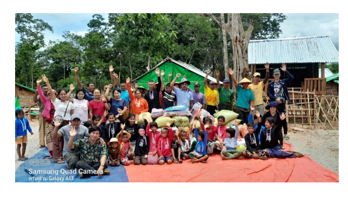
Waan Nam Hu, Keng Tawng, Loi Lem, Shan State Burma: the photo was taken at the conclusion f a GLC program. They children received shirts, snacks and a day of fun.