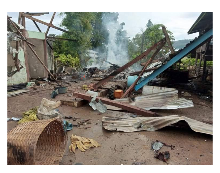
The Displaced Village, Pekon, Karenni State: This is the village that the IDPs were displaced from. The photos were taken when the IDPs returned to check on their things.