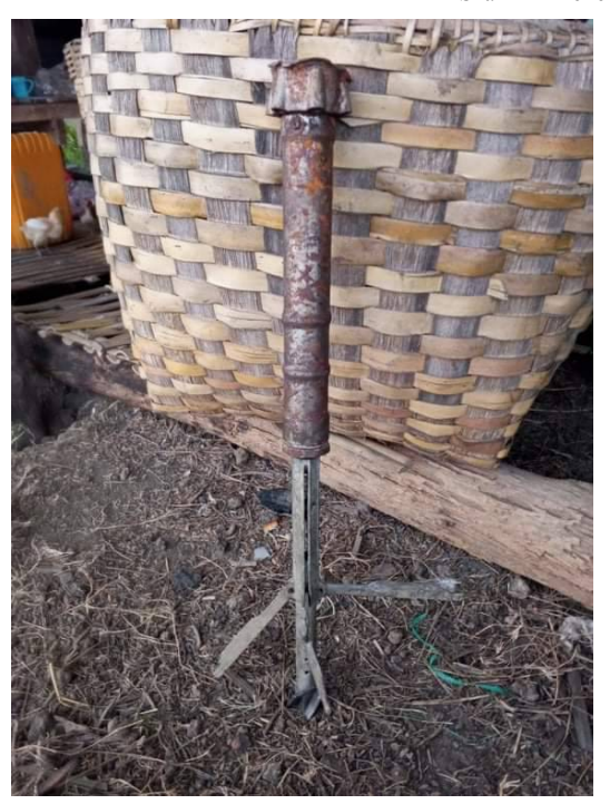
The Displaced Village, Pekon, Karenni State: this unexploded ordnance was found in the village.