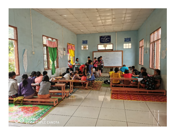
Waan Won Som, Loikaw, Karenni State: Grade 1 and 2. This is the classroom for grades one and two. The teachers and student would both benefit from teaching guides and student books. They don't currently have Myanmar Standard curriculum instead the construction is subsidized by the Shan Army. They don't provided the same curriculum as they students in Central Burma.