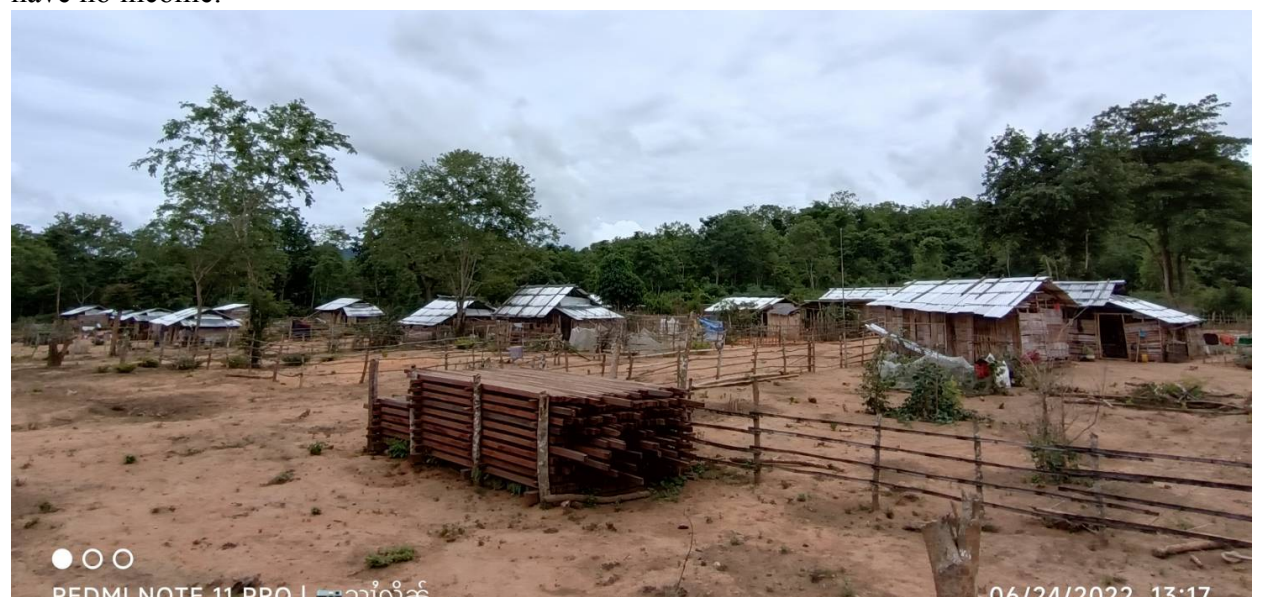
Waan Mai and Wo Long, Keng Kam, Kunhing, Loi lem, Shan State Burma: The IDP camp is very hot and it is difficult to access the river.

This IDPs camp is very far from the town and the road is very bad. It's setting beside the big river named Pang River so the weather is hot and humid all the time. Even this IDPs camp is close to the big river but the IDPs people can not benefit from the river as much because the river is deep and dangerous to their children. Their houses are very small and close to each other. Therefore, there is not much area for growing vegetables for eating. We walked around the camp and it revealed that their sanitation was not good because they did not have sanitary toilets and there are no doctors here. The IDPs people here still lack food. They also cannot rely on themselves and have to wait for people to donate food because they are far away and have no income.