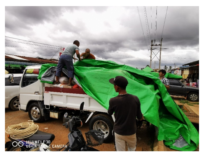
Waan Won Som, Loikaw, Karenni State: The supplies are covered with a tarp to protect them from the weather and disguised it from the Burma Army.