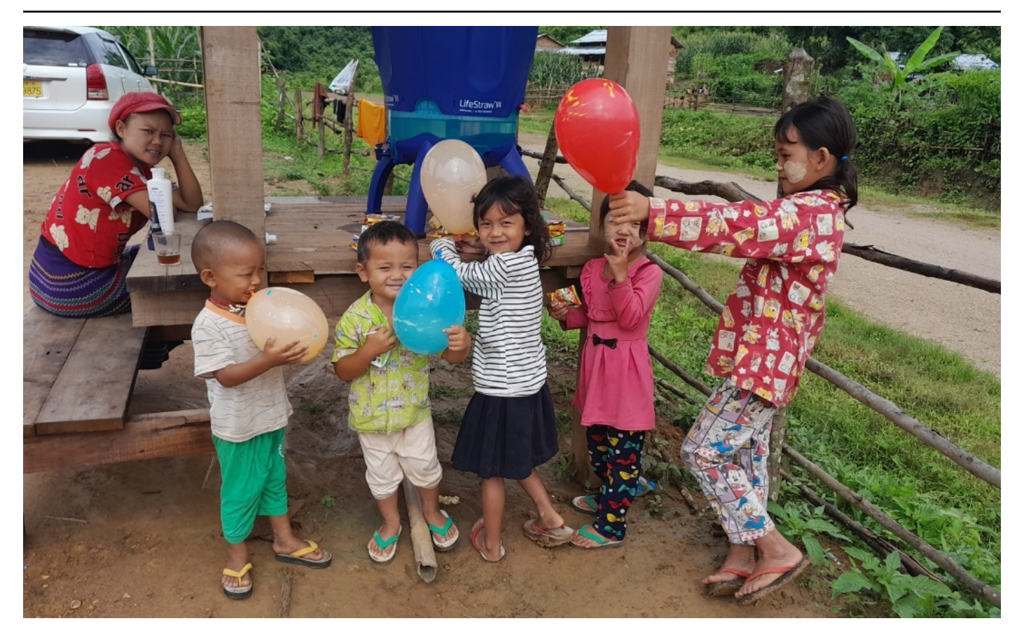
Waan Pieng Sha (Nam Jha), Keng Tong, Loi Lem, Shan State Burma: Balloons are distributed to the children.

This small IDPs camp close to Pang River but the weather is not too hot. Of all the visits to IDPs camp, this is where the village location is the best because it is not far from the big river. There is a small river nearby and IDPs camp here is right next to a small village road. Every house will grow vegetables donated by our seeds when they fled here last year. They also farm corn to earn money but their children have no school to attend.