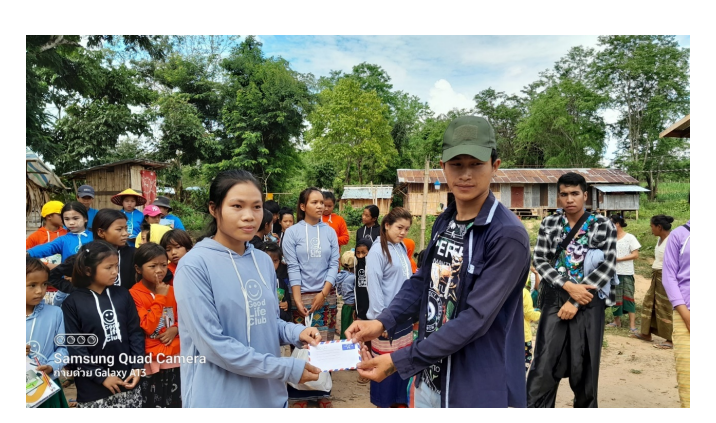
Waan Mai and Wo Long, Keng Kam, Kunhing, Loi lem, Shan State Burma: Teacher receiving support for all the village teachers, students, and the school.