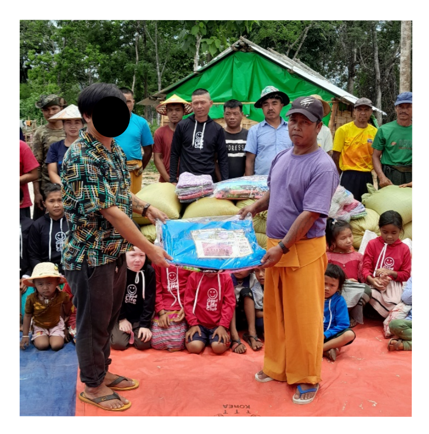
Waan Nam Hu, Keng Tawng, Loi Lem, Shan State Burma: The team giving mosquito net to IDPS.