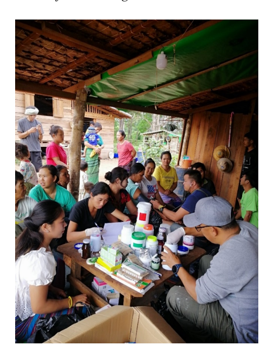
Waan Nam Hu, Keng Tawng, Loi Lem, Shan State Burma: The Ranger team provided a medical clinic to the IDPs.