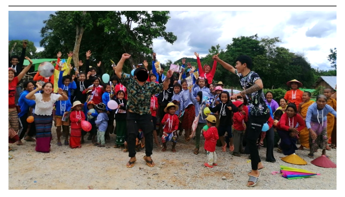
Waan Nam Hu, Keng Tawng, Loi Lem, Shan State Burma: This photo was taken at the conclusion of a GLC program.

This IDP camp is in the forest so there are a lot of mosquitoes here. This place is far from the village and there is no water so they had to walk for 10-15 minutes to get the water. From talking to them they said that they were hired to grow corn and plant a garden in the village to raise money to build a stronger house because they could no longer return to their home. Their children went to study with the monks at the village temple because there were no schools and doctors here, it was quite difficult for them to live here.