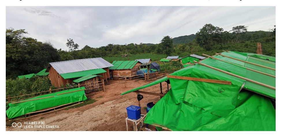
Waan Nam Hu, Keng Tawng, Loi Lem, Shan State Burma: these people were displace in December 2021 but they are still using tarps for roofs. These tarps need to be replaced once a year.

This IDP camp is in the forest so there are a lot of mosquitoes here. This place is far from the village and there is no water so they had to walk for 10-15 minutes to get the water. From talking to them they said that they were hired to grow corn and plant a garden in the village to raise money to build a stronger house because they could no longer return to their home. Their children went to study with the monks at the village temple because there were no schools and doctors here, it was quite difficult for them to live here.