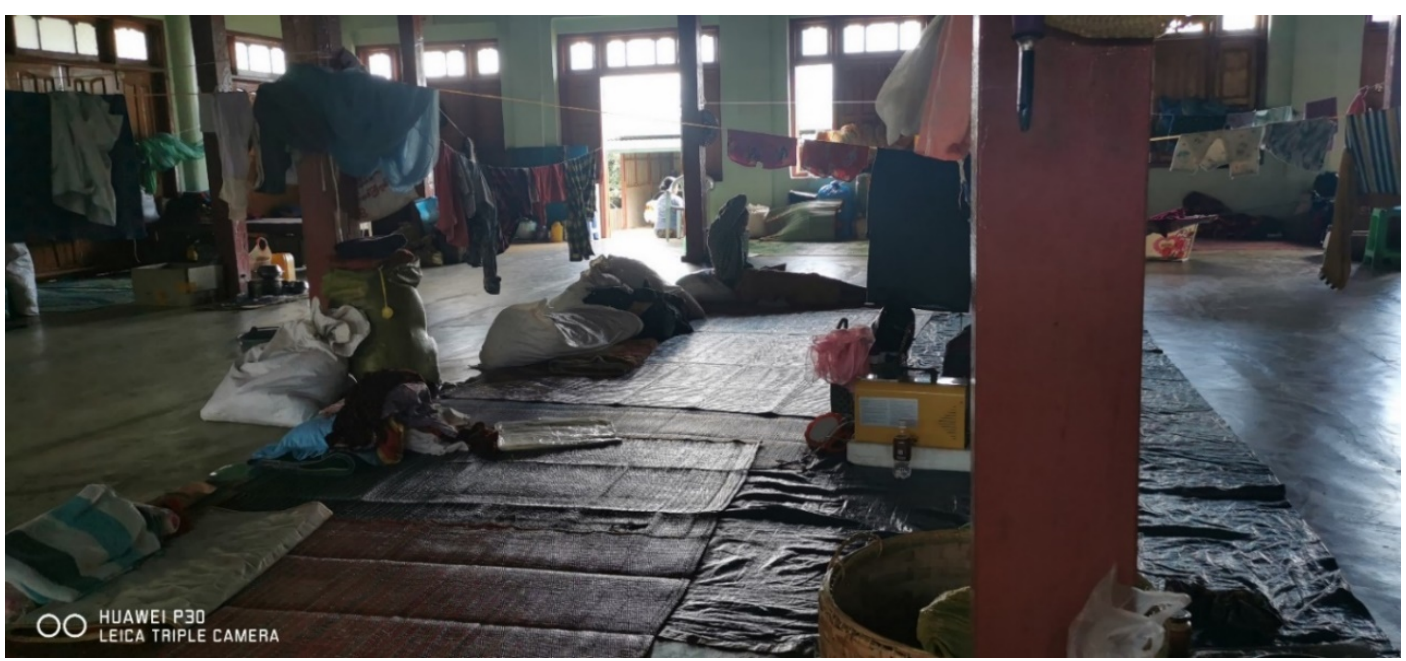
Waan Won Som, Loikaw, Karenni State: The IDPs live in one large building there is no privacy. They use tarps on the ground to designate their living space. The IDPs said there is not enough toilets for them use.