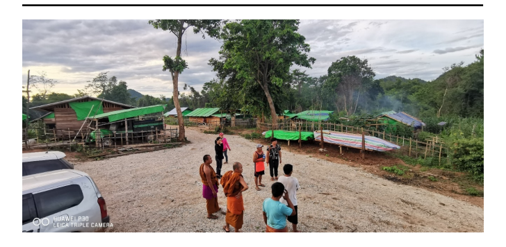
Waan Nam Hu, Keng Tawng, Loi Lem, Shan State Burma: This is the first time they arrive at IDP camp.