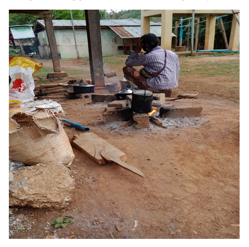
Waan Won Som, Loikaw, Karenni State: This is an example of a cooking area for the IDP families. The temple has one kitchen that the IDPs can access but it is impossible for everyone to use. They need to support so families can have a better place to cook and prepare meals.