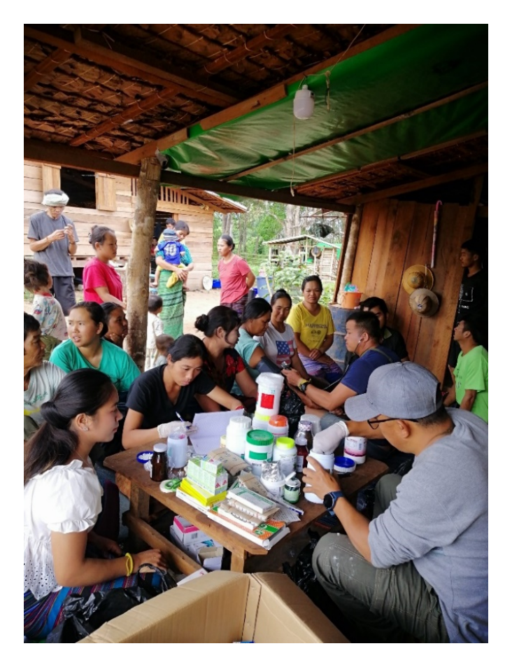
Waan Nam Hu, Keng Tawng, Loi Lem, Shan State Burma: The ranger team provided a medical clinic to the IDPs.