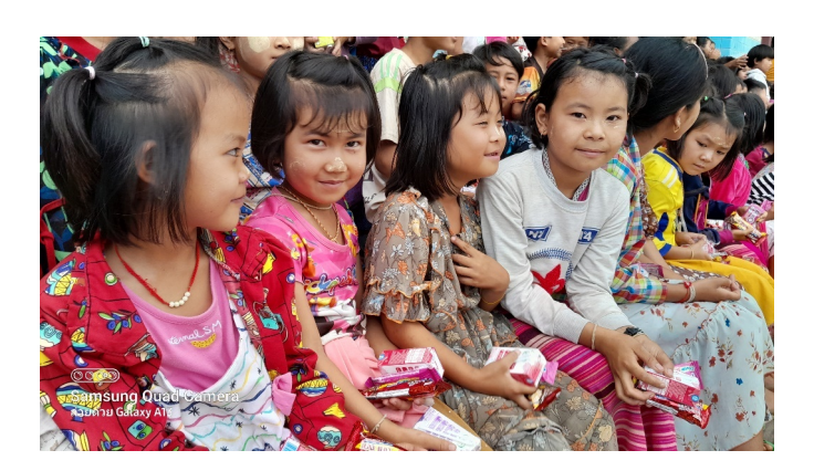
Waan Won Som, Loikaw, Karenni State: IDP children receive snack.