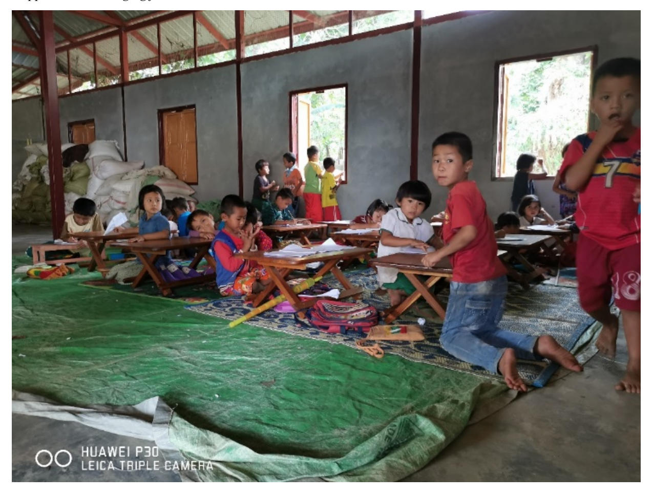
Waan Won Som, Loikaw, Karenni State: This is the preschool classroom. The Temple has several building and three of them have been transformed into class rooms.