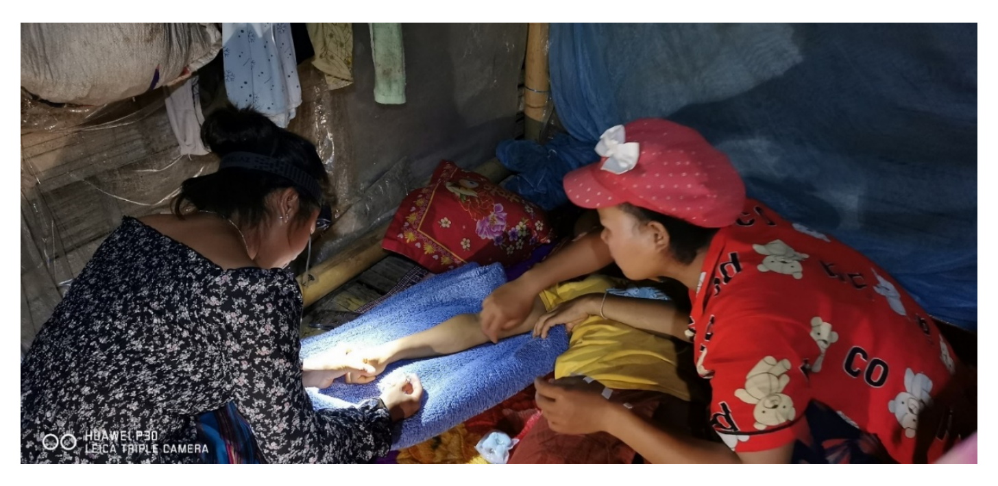
Waan Mai and Wo Long, Keng Kam, Kunhing, Loi lem, Shan State Burma: The IDPs contacted the ranger team at night to inform them of a women with a high fever. The medic traveled back to the women's house and treated her.