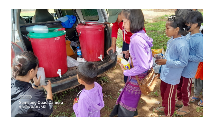
Good Life Club and Pong School, Hai Hpak, Nansang, Shan State Burma: Children were given sweet milk tea for snack.