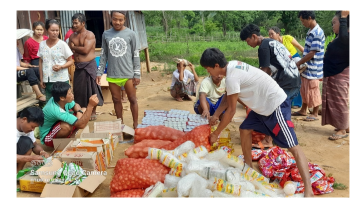
Waan Mai and Wo Long, Keng Kam, Kunhing, Loi lem, Shan State Burma: Food distribution.