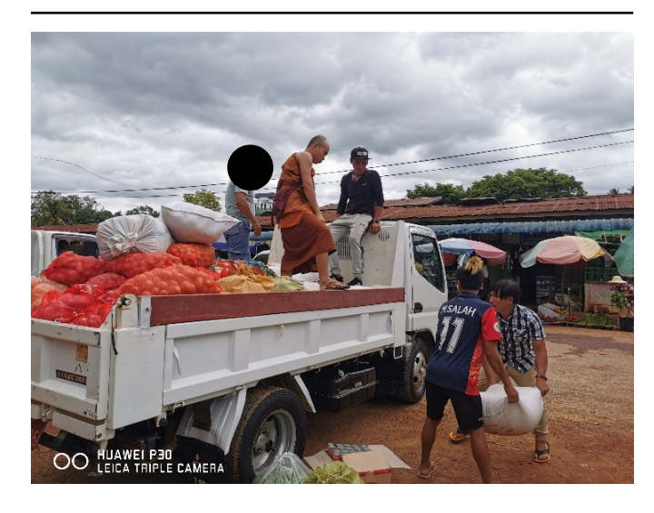
Waan Won Som, Loikaw, Karenni State: The Shan Ranger team loading food supplies into a truck to be delivered to IDP's