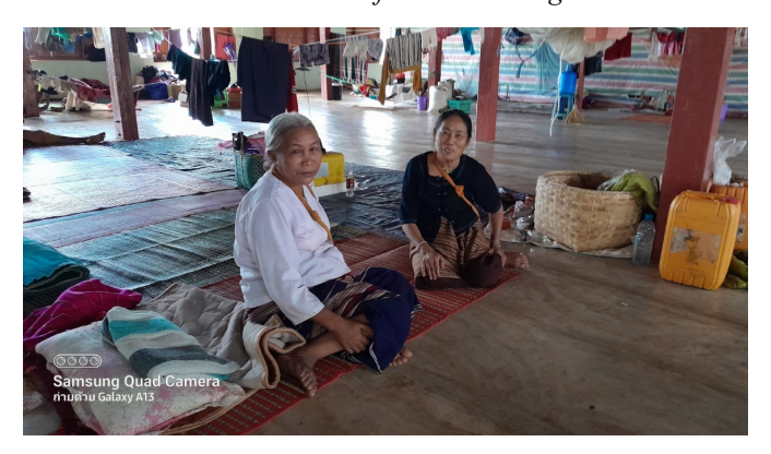
Waan Won Som, Loikaw, Karenni State: 2 IDPs in there living space. They have no walls and "their space" is denoted by the tarp.