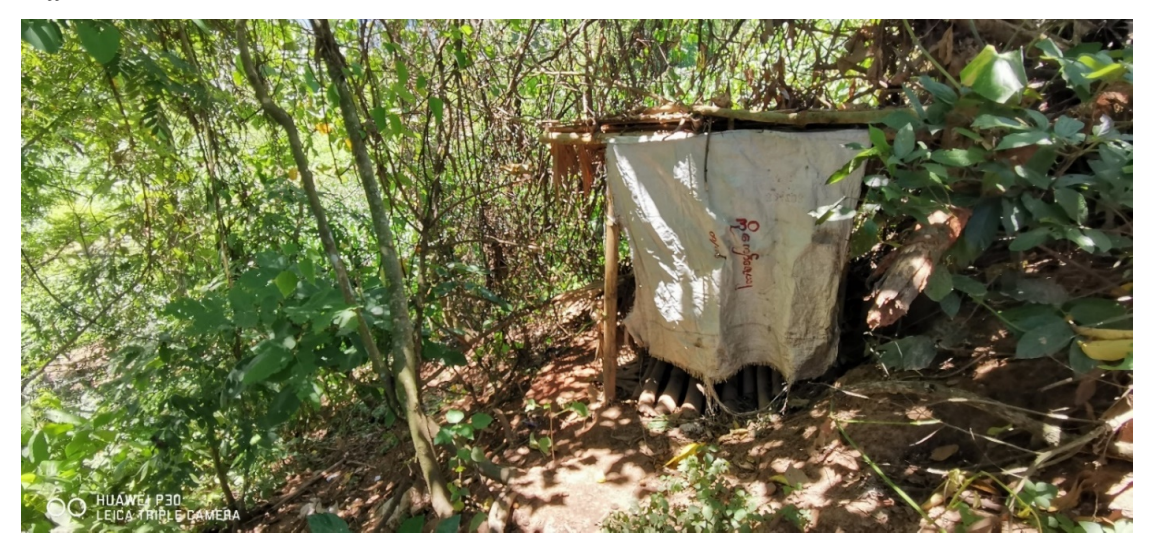
Waan Mai and Wo Long, Keng Kam, Kunhing, Loi lem, Shan State Burma: The IDP camp needs to invest in sanitation and build more bathrooms. The bathroom above is used by two or three families.