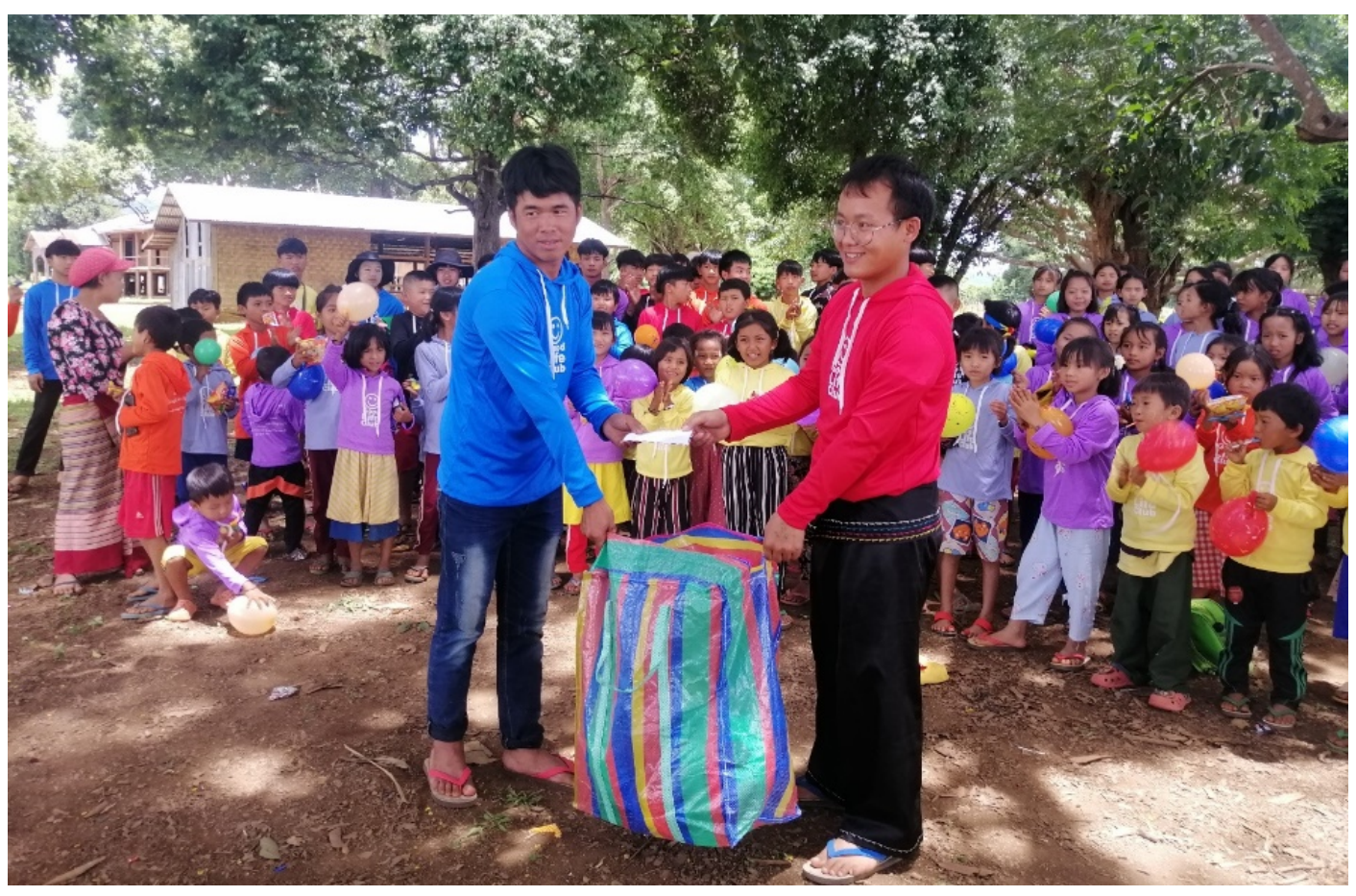
Waan Pong School, Hai Hpak, Nansang, Shan State Burma: Ranger provides a school pack. It contains football, volleyball and net, school supplies, notebooks, seeds for planting, anatomy apron, ORS guides to teach about treatment of dehydration, hair clippers, Day of Prayer Magazine, balloons, beads, and a christian coloring book.