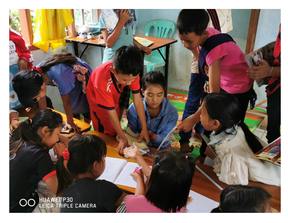
Waan Won Som, Loikaw, Karenni State: Students gathered around a table to completing an assignment.