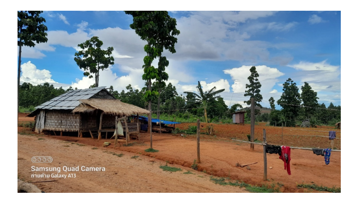
Waan Won Som, Loikaw, Karenni State: This picture show the village where several IDPs have sought shelter with the villagers. Several IDPs are living in the homes of villagers other have built shelters among the village. These are the christian refugees from Karenni.