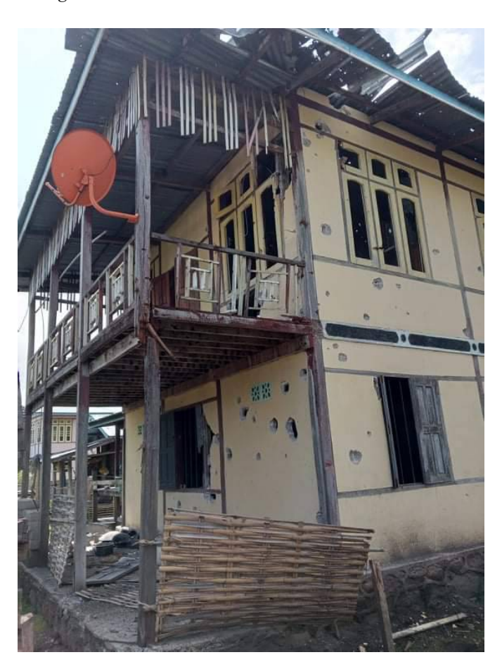
The Displaced Village, Pekon, Karenni State: This home was destroyed by the fighting between Burma Army and resistant forces.