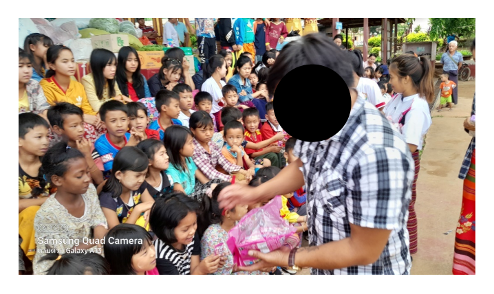
Waan Won Som, Loikaw, Karenni State: Rangers hand out a snack at the conclusion of a GLC program.