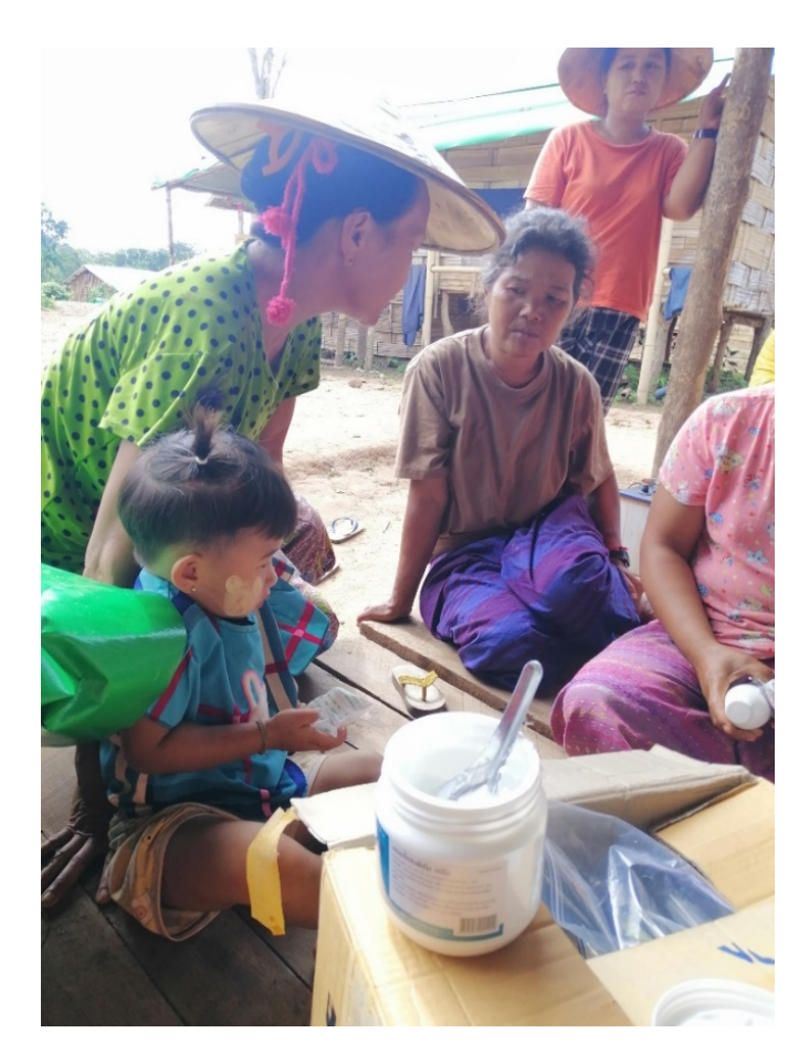
Waan Nam Hu, Keng Tawng, Loi Lem, Shan State Burma: This child is receiving treatment at the medical clinics from the ranger medics