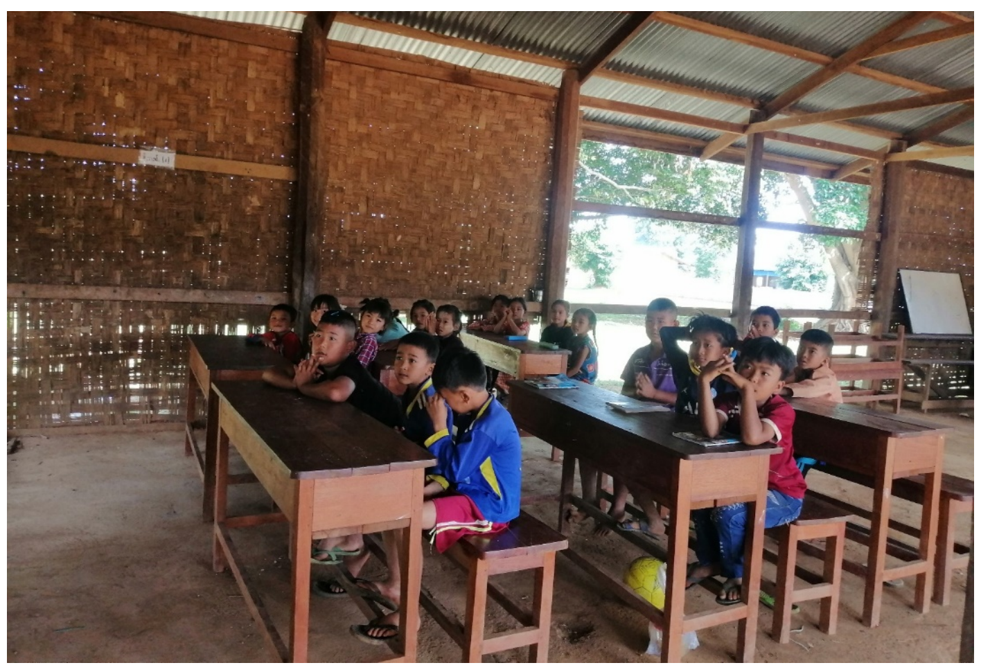
Waan Pong School, Hai Hpak, Nansang, Shan State Burma: This school building doesn't have separate classroom this room houses grades 1 to 4. They don't have walls separating the classroom so the teacher face the students in different directions.