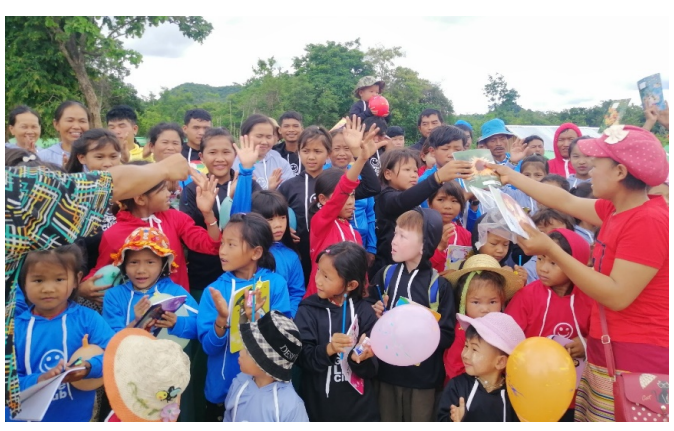
Waan Nam Hu, Keng Tawng, Loi Lem, Shan State Burma: Photo was taken at the conclusion of a GLC program. The children received balloon school supplies and a snack.