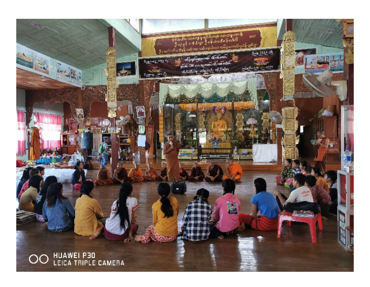
Waan Won Som, Loikaw, Karenni State: (Grades 6 to 10) are taught by the monk on the second floor of the temple.