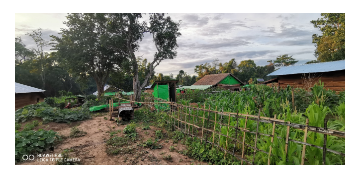
Waan Nam Hu, Keng Tawng, Loi Lem, Shan State Burma: The IDPs have begun to plant small gardens to support their families. This garden don't produce enough calories to sustain the families but does subsidize the food support they receive. This is the second time our team has visited this camp. The team provided the villagers with seeds to plant their gardens. They requested more seeds.