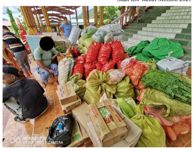
Waan Won Som, Loikaw, Karenni State: The food supplies organized for distribution at the front of the temple.