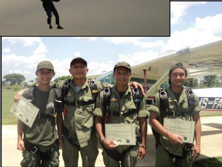
Photos of Rangers in the air and on the ground during an FBR Jump Training session in 2012.